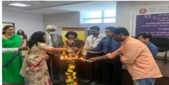
Inauguration of SWASTYA 2.0 on 10th April 2023

DEPARTMENT OF TRANSFUSION MEDICINE: WORLD HEMOPHILIA DAY: "ACCESS FOR ALL. PREVENTION OF BLEEDS AS GLOBAL STANDARD OF CARE"