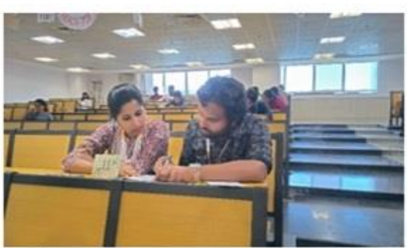
Registration & Prelims of SWASTYA 2.0